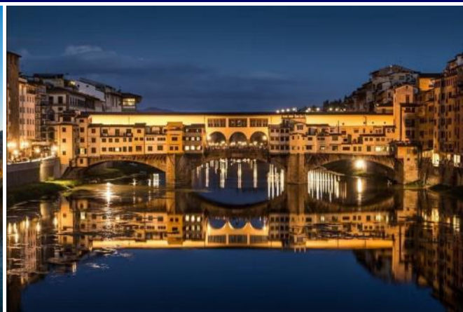
The Ponte Vecchio in Florence