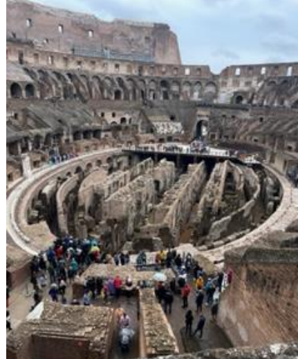
At the Colosseum in Rome