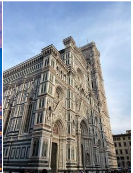
Cattedrale di Santa Maria del Fiore in Florence

before. I will miss taking the extremely packed metro to get across Roma, where you can't even move in the train because there is nowhere else to go, but it is impossible to not feel the presence of so many other humans there for the same reason. I will miss being lost in thought and suddenly hearing my name being called over to translate Italian. I will miss walking everywhere tremendously, particularly to my favorite place in the world every evening to watch the sunset and feel the humanity in the atmosphere. I will miss the passion for calcio ("soccer") that most, if not all, Italians share. I will miss the feeling of finally belonging somewhere. But I promise I will be back, and one day it will be to not have to leave again.